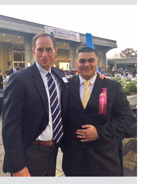
Devore Family Memorial Scholarship presented to SWC student who went on to graduate from SDSU

perhaps, the most impactful type of contribution in higher education. These funds are made up of financial gifts that are invested for growth with the option to have them endowed, allowing donors to create living legacies that span generations.