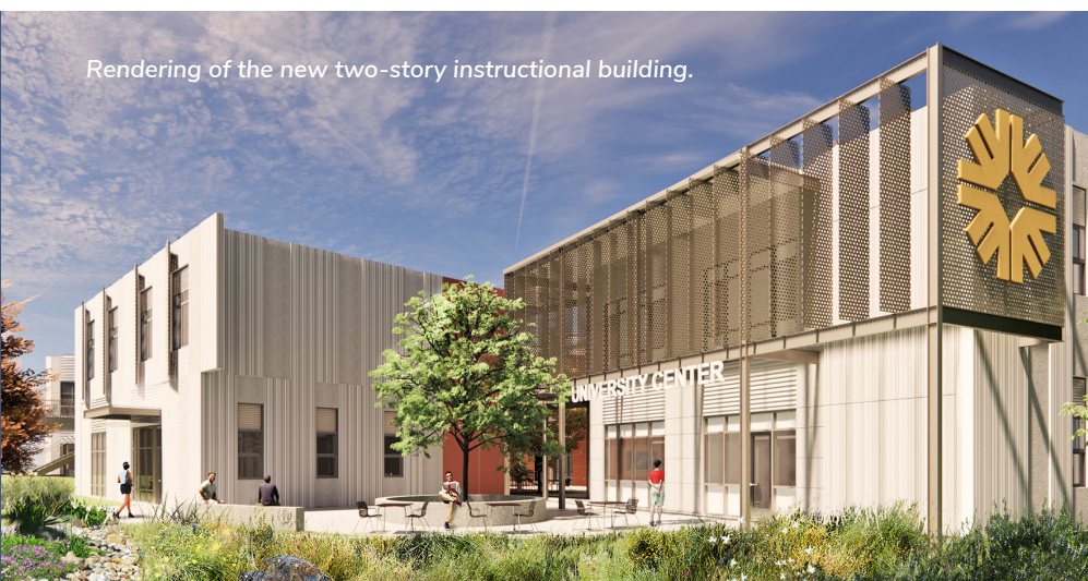
Rendering of the new two-story instructional building.

Project Status: Design complete and in review with Division of State Architect