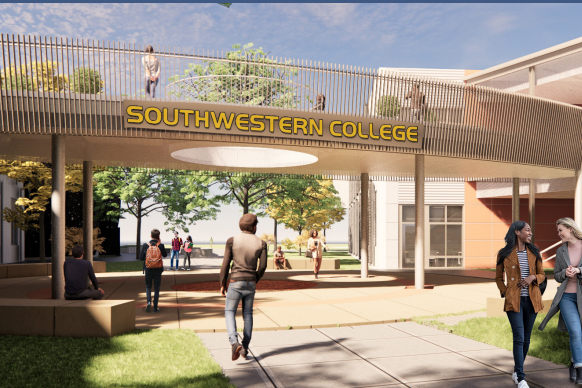
Rendering of bridge connecting the two classroom portions of Instructional Building 1.