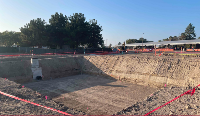
Preparing the site for the facilities and warehouse relocation.