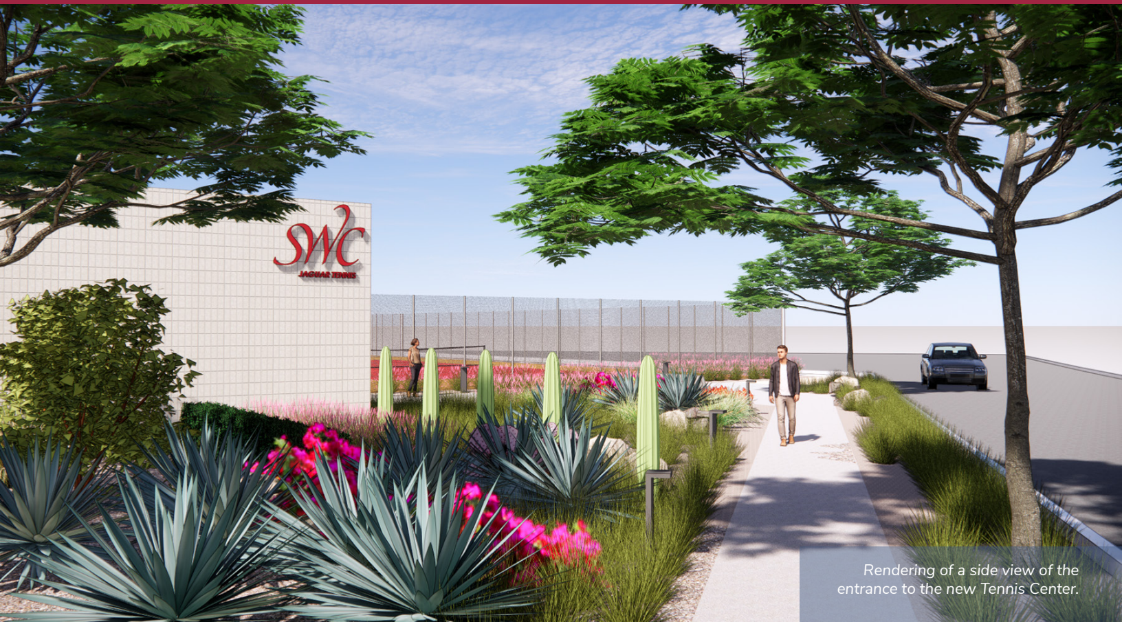
Rendering of a side view of the entrance to the new Tennis Center.

FOR THE PERIOD: JULY 1, 2020 - JUNE 30, 2021