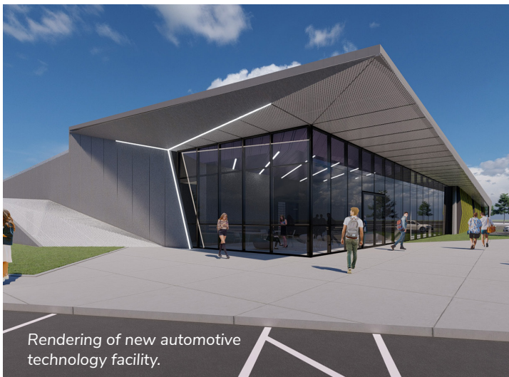
Rendering of new automotive technology facility.

Project Status: Design approved by Division of State Architect and going to bid in 2022