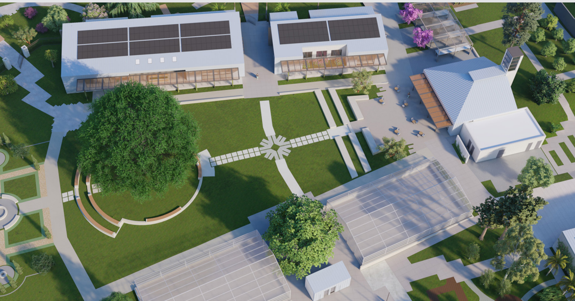
Landscape and Nursery Technology aerial rendering of the proposed renovations and construction.