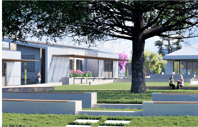
Rendering shows outdoor and indoor learning spaces are key in new LNT design.