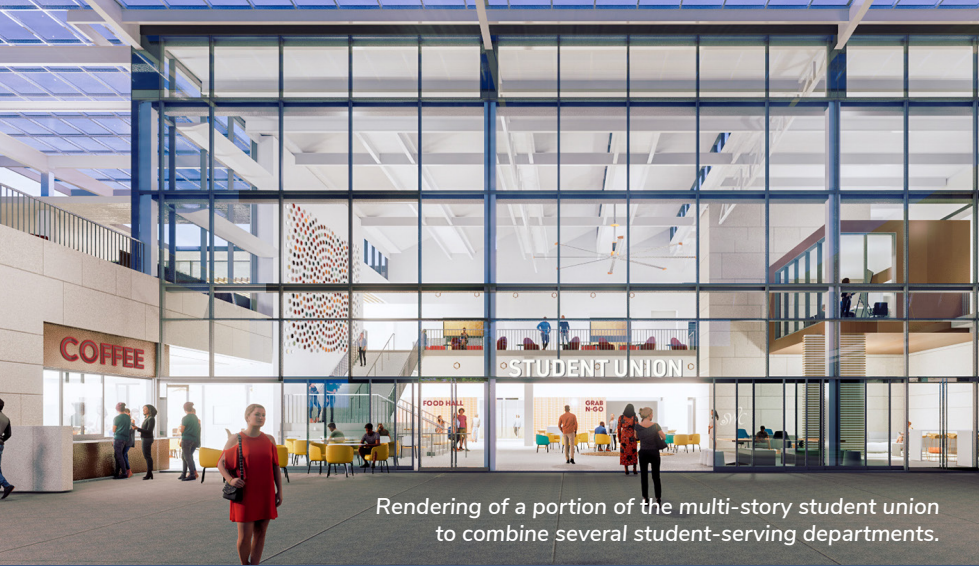
Rendering of a portion of the multi-story student union to combine several student-serving departments.

STUDENT UNION COMPLEX This project in the heart of the Chula Vista campus will offer a range of activities and spaces for students to gather, socialize and interact with their peers. Balancing a number of small, discrete spaces with larger, flexible spaces, the student union will house the Associated Student Organization (ASO), bookstore, SWC Cares Hub, culinary arts, learning communities, the Veterans Resource Center and Health and Personal Wellness facilities. Food service and dining areas will connect indoor and outdoor terraces and patios. The new facility replaces the existing Student Union and cafeteria buildings.