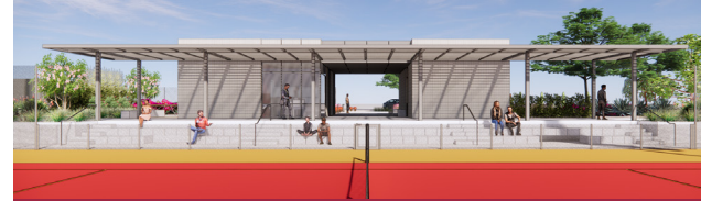
Rendering view of fan-seating area.

Project Status: Approved by Division of State Architect and going to bid in 2022